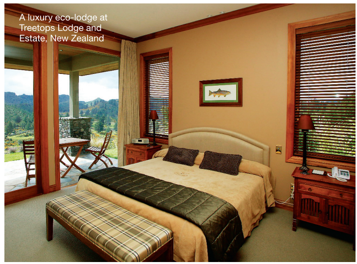
A luxury eco-lodge at Treetops Lodge and Estate, New Zealand

A natural stream and man-made waterfall surround the entrance to the stone and timber lodge. Comfortable, natural elegance is the