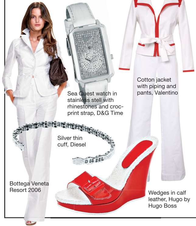
Sea Quest watch in stainless steel with rhinestones and croc-print strap, D&G Time