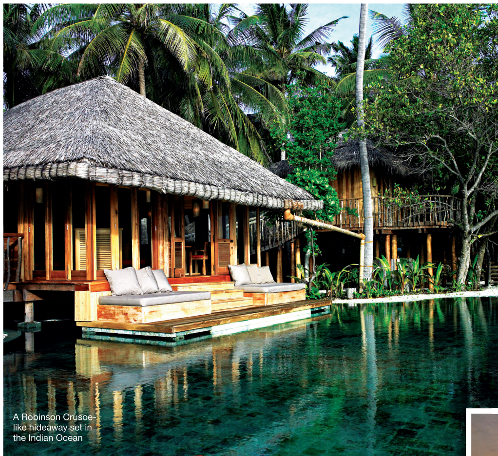
A Robinson Crusoe-like hideaway set in the Indian Ocean