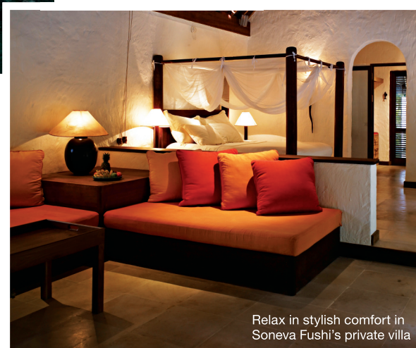
Relax in stylish comfort in Soneva Fushi's private villa

food. For adventurous guests there is windsurfing, water-skiing, fishing and some of the best diving in the world.